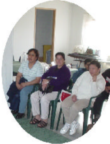
Pictured are a few Steering Committee members gathered for strategic planning.

In 2000, a group of 20 Mexican farmworker women living in Mattawa, a small farm town in Central